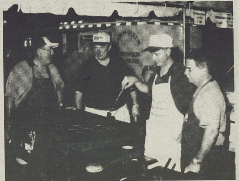
Members of the Columbus Lions Club will return to the fair again this year to cook up their famous Lion Burgers for hungry fair patrons. The Lions will also sponsor Turtle Races on Thursday night.